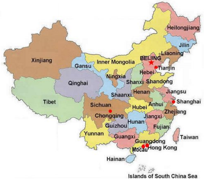
Map of China