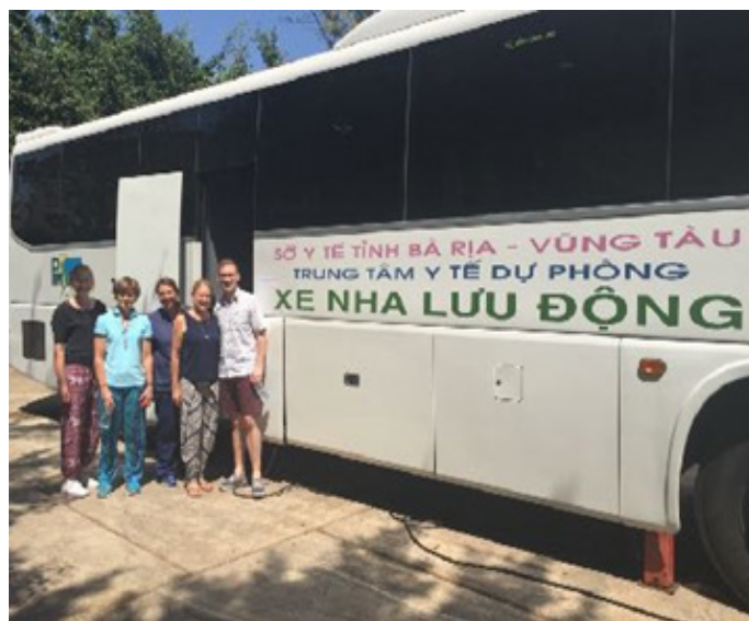
Mobile bus clinic for the Vietnam Long Tan dental project

In June a Vietnamese speaking dentist accompanied a hygienist and an orthodontist and for the first time treated children at an orphanage in Ba Ria which had initially been built and organised by our parent NGO, AVVRG (Australia Vietnam Volunteers Resource Group). This was possible because it was summer school holidays and the orphans were in residence and not at school. This should now become an annual visit. A new Catholic day care centre was also offered treatment but most of the children were too young. Finally, some adults were treated at the static Long Tan Clinic.