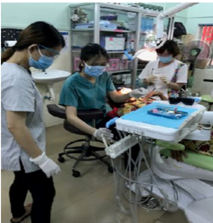
UQ student working in Cambodia