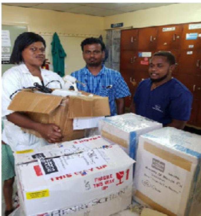
Dental donations gratefully received